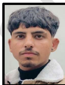
Vanish 1 st Position BCA 1 st Year