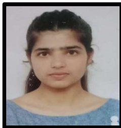
Palvi 2 nd Position M.a (Pbi) 1 st Year